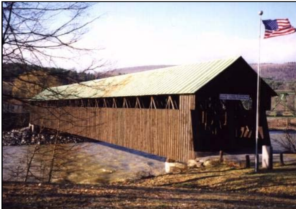
Blenheim Bridge on Jan. 1998