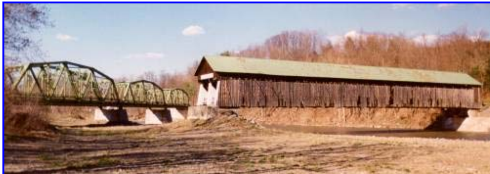
Panoramic photo of Blenheim Bridge over Schoharie Creek before 1998 rehabilitation

Parking available on either side of bridge. Across the road from the town garage on the north end of the bridge or on the south side of the bridge take a sharp right after crossing steel truss.