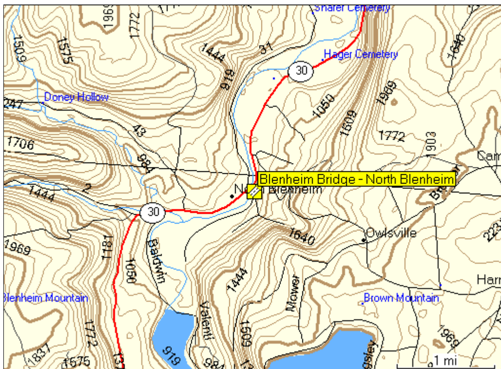
The bridge is located in the Town of North Blenheim in Schoharie County