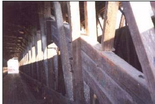
The Truss is a Long Truss with a Center Arch