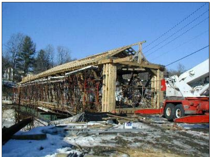
Buskirk Construction Project - February 2005