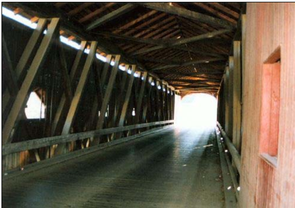
Buskirk Bridge Truss