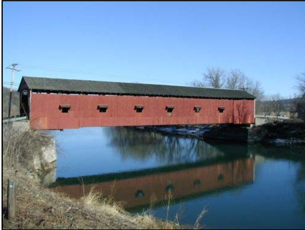
Buskirk Bridge in winter of 2002

Buskirk, NY - Washington and Rensselaer Counties