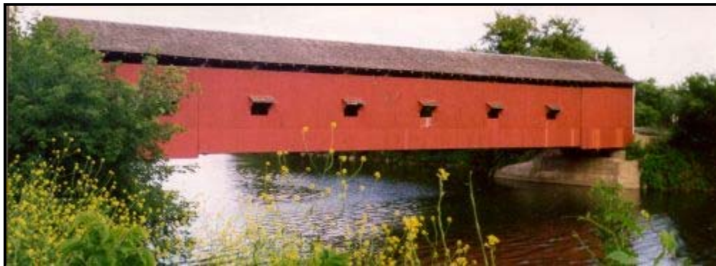
Panorama of Buskirk Bridge