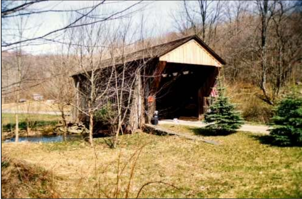
Photo of Campbell Bridge