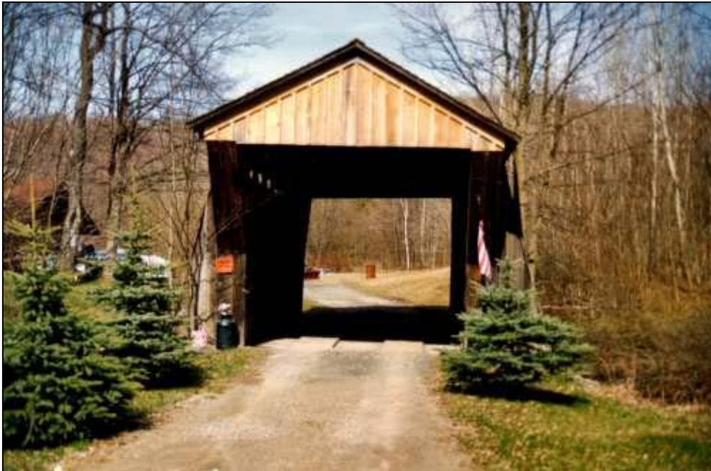
Campbell Bridge Portal