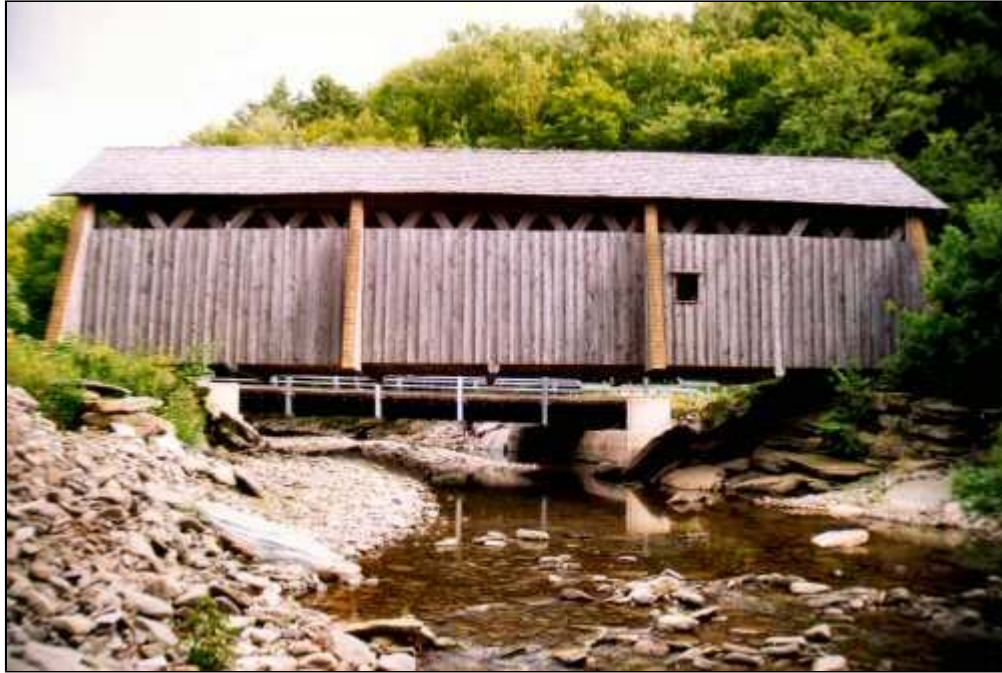
Photo of Grants Mills Bridge