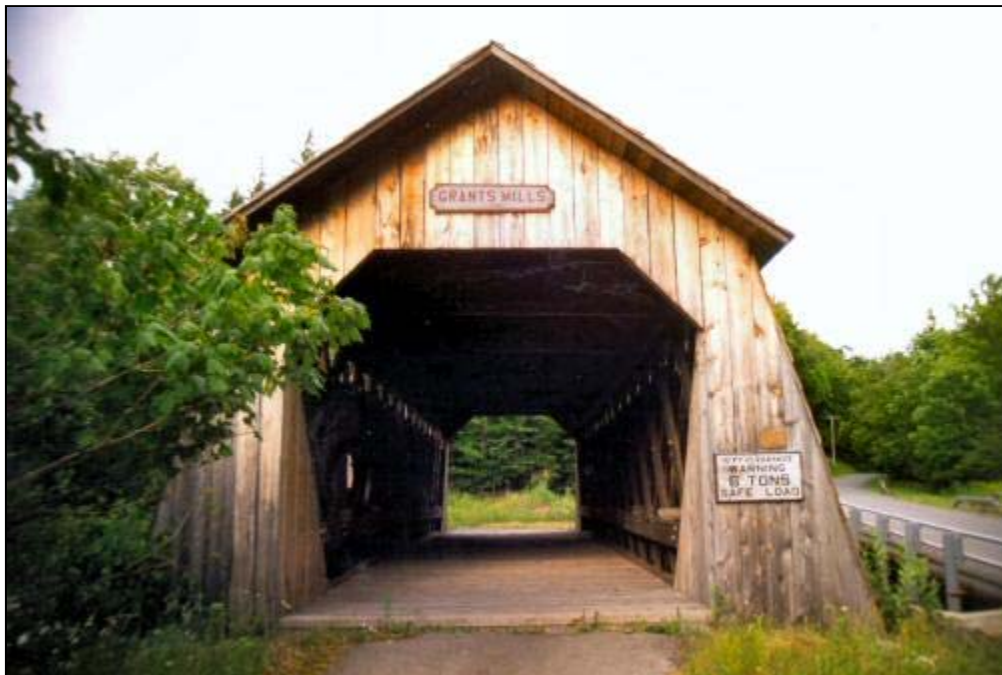
Grants Mills Bridge Portal