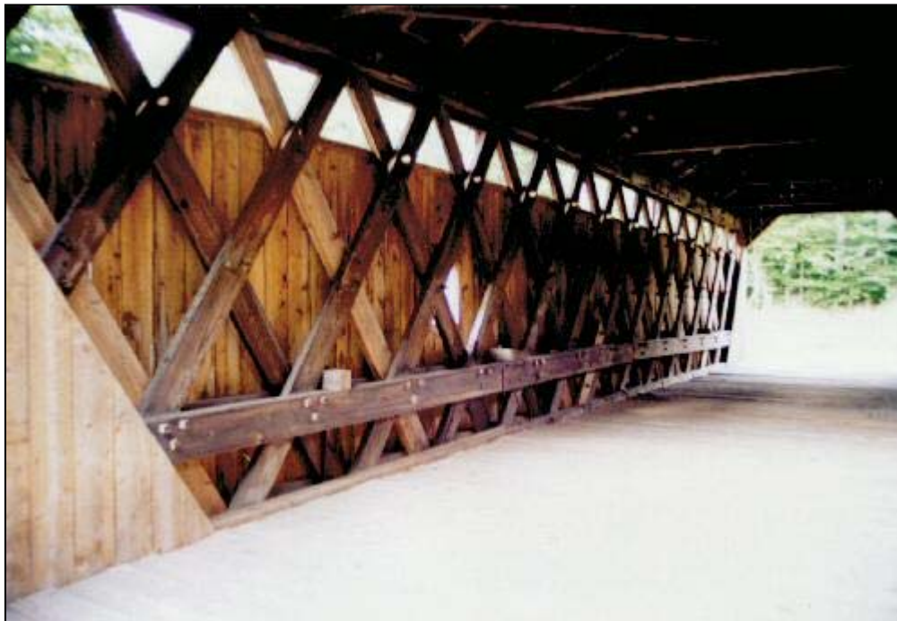
Town Lattice Truss