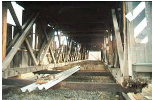
Jay Bridge photos after June 12, 1997