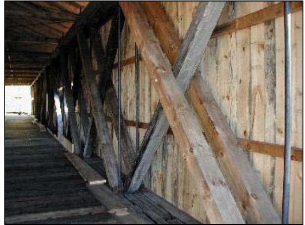
Jay Bridge photos October 3, 2004