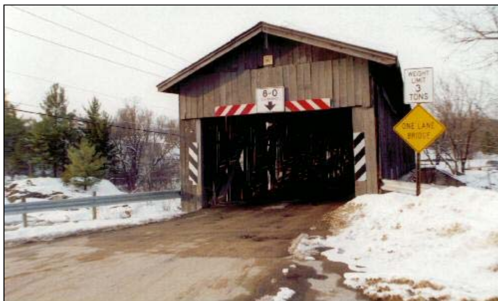
Jay Bridge Portal - before June 12, 1997