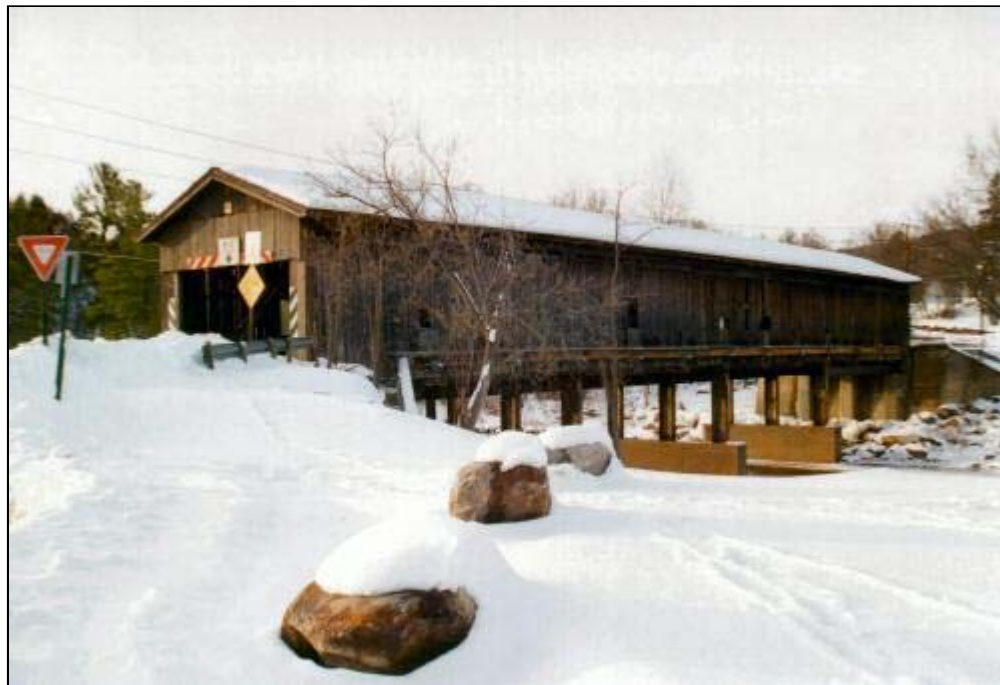
Jay bridge before June 12, 1997