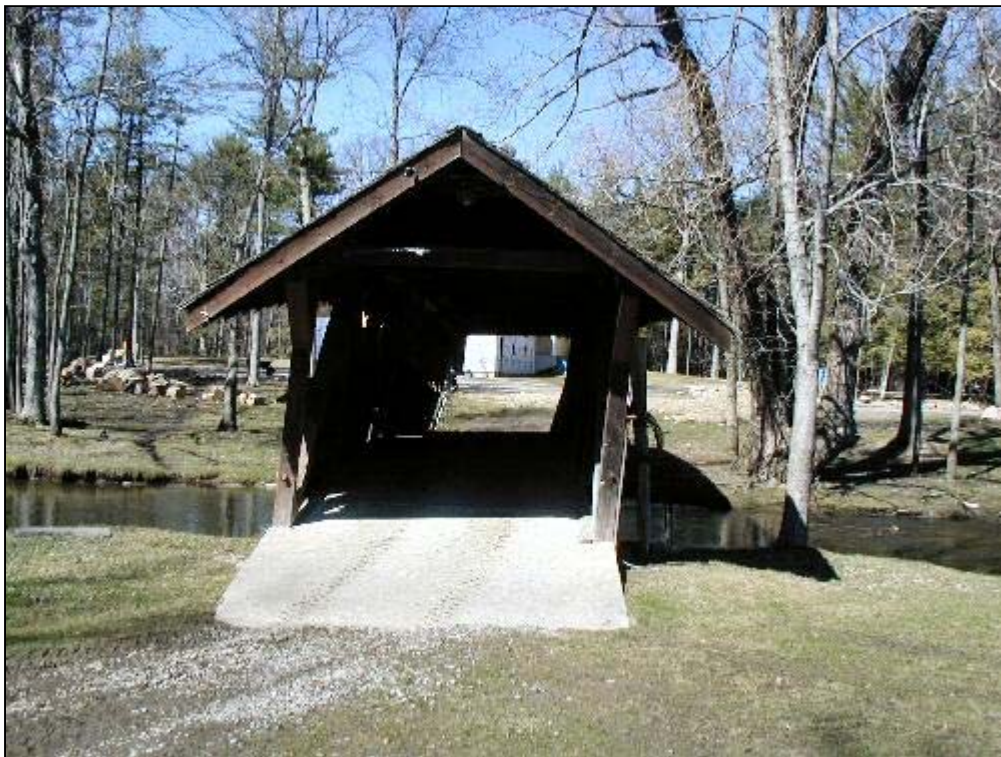
Photo of Mead Bridge Portal