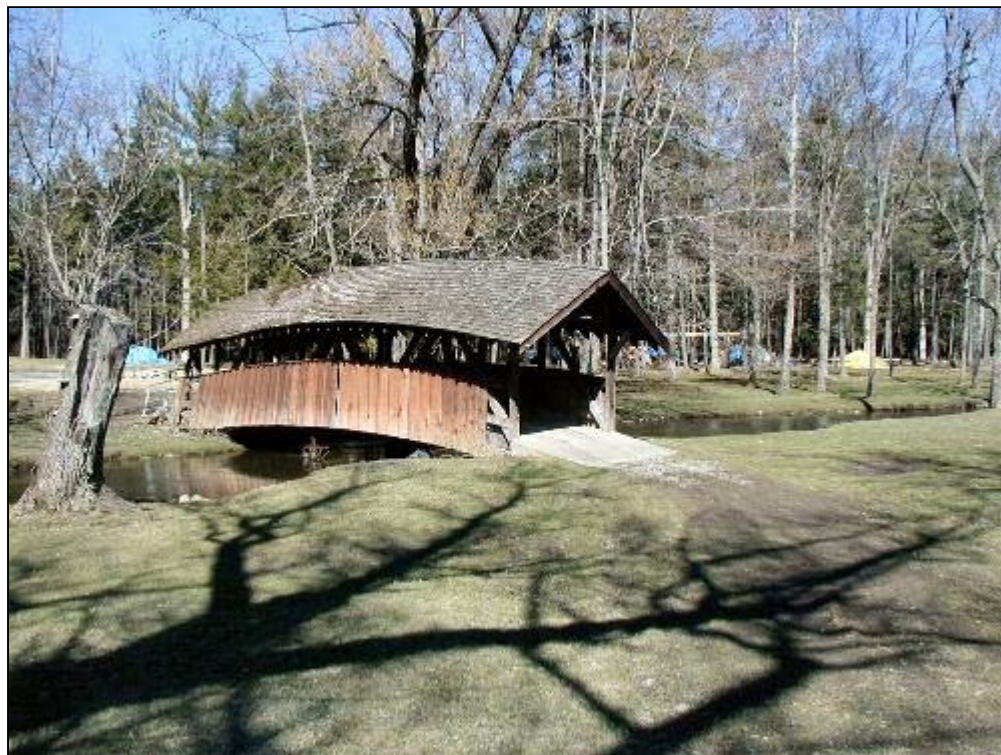
Photo of Mead Bridge