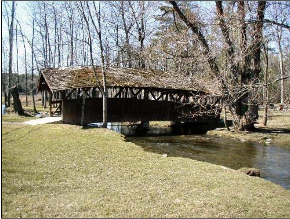
Photo of Mead Bridge