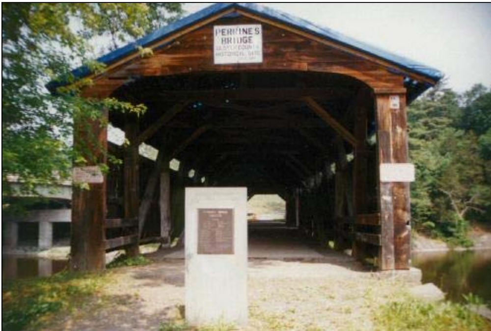
Perrine's Bridge Portal