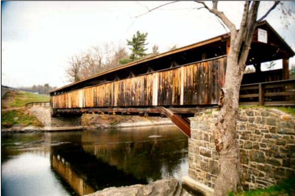
Photo of Perrine's Bridge