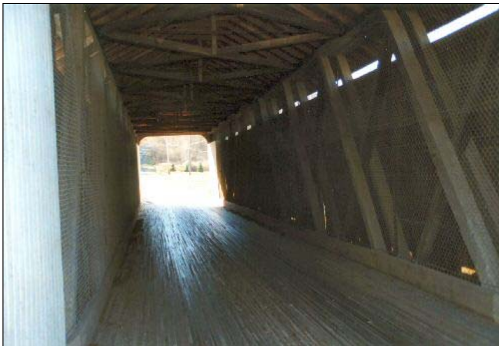
Rexleigh Bridge Truss