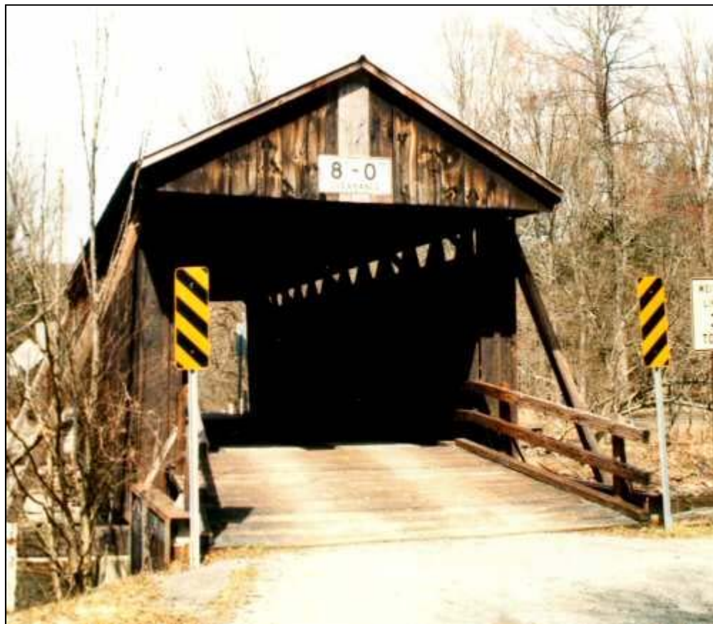
Bendo Bridge Portal